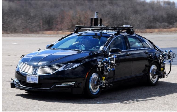
Figure 1: Hybrid Lincoln MKZ with VMS attached