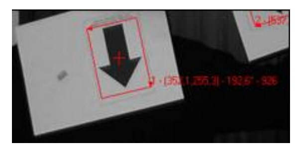
Figure 4: Testing pattern recognition

The image toolbox of Labview (IMAQ Vision) performed very nicely, detecting the arrow patterns with normal webcams (see Figure 4). The \{x, y, \alpha\} information was used both to detect the path the robot had to follow and to have a practical example of the PatternRecognition system definition.