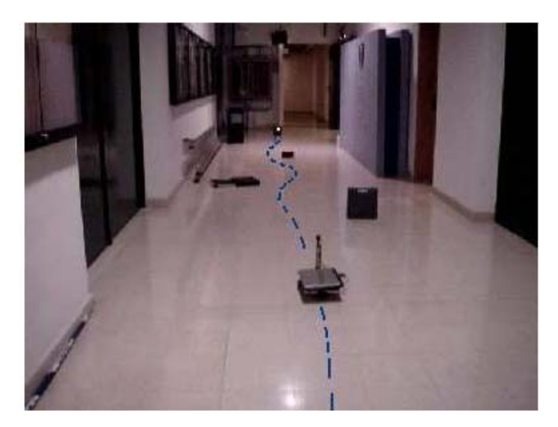
Figure 6: Obstacle avoidance

The Artificial Vision Course is optional for 5th year students. It is aimed for applications towards Machine Intelligence, e.g., Robot vision, Automatic Inspection and Autonomous Machines. Among these, autonomous vehicles are a good basis for work. Different tasks can be performed in different environment conditions which can be controlled to a certain degree. Applications to drive the platform in different environment conditions were implemented, mainly to follow to a target avoiding sparsely obstacle randomly positioned. Examples are presented in Figure 6, where driving through a luminous target is made in a corridor with shinning floor and mixed illumination conditions.