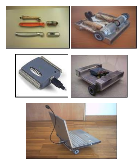
Figure 1: Mobile Robot built

Figure 1 shows the mobile robot built where we may see several robot components and the final assembly. The advantage of such a simple robot is that it becomes possible to lend the robot to the students freeing the laboratories occupancy and providing a new challenging and unusual peripheral for the students own laptops.