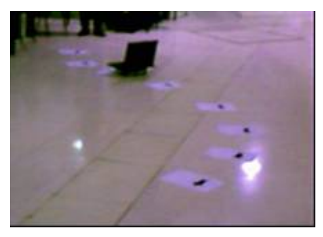
Figure 3: The robot guided by the arrows

These simple concepts were illustrated with the mobile robot platform. For the competition, Systems and Signals students were able to use more straightforward tools than the hard C#. Students were divided by the use of Matlab or Labview. In the competition, the robot had to accomplish the mission of autonomously going from one laboratory to the other by using the minimum number of arrows on the floor (see Figure 3).