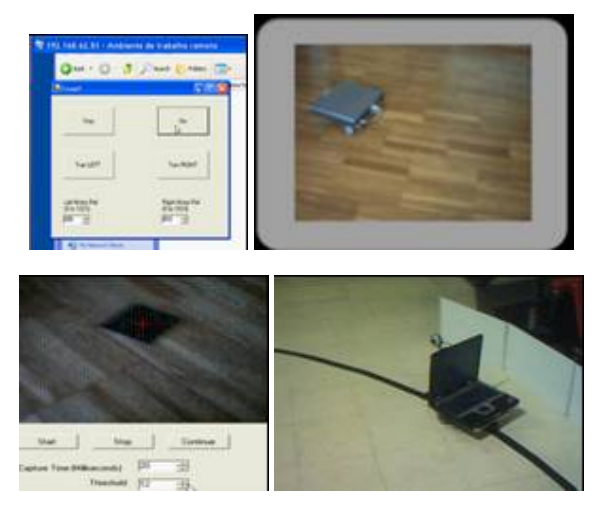
Figure 2: Test software and a line follower

Figure 2 presents the robot with the standard package installed and performing a line follower task.